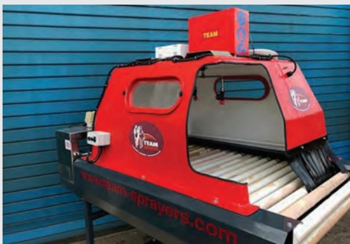
Team Sprayers CTC 2 air treatment canopy